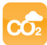
Effet de serre